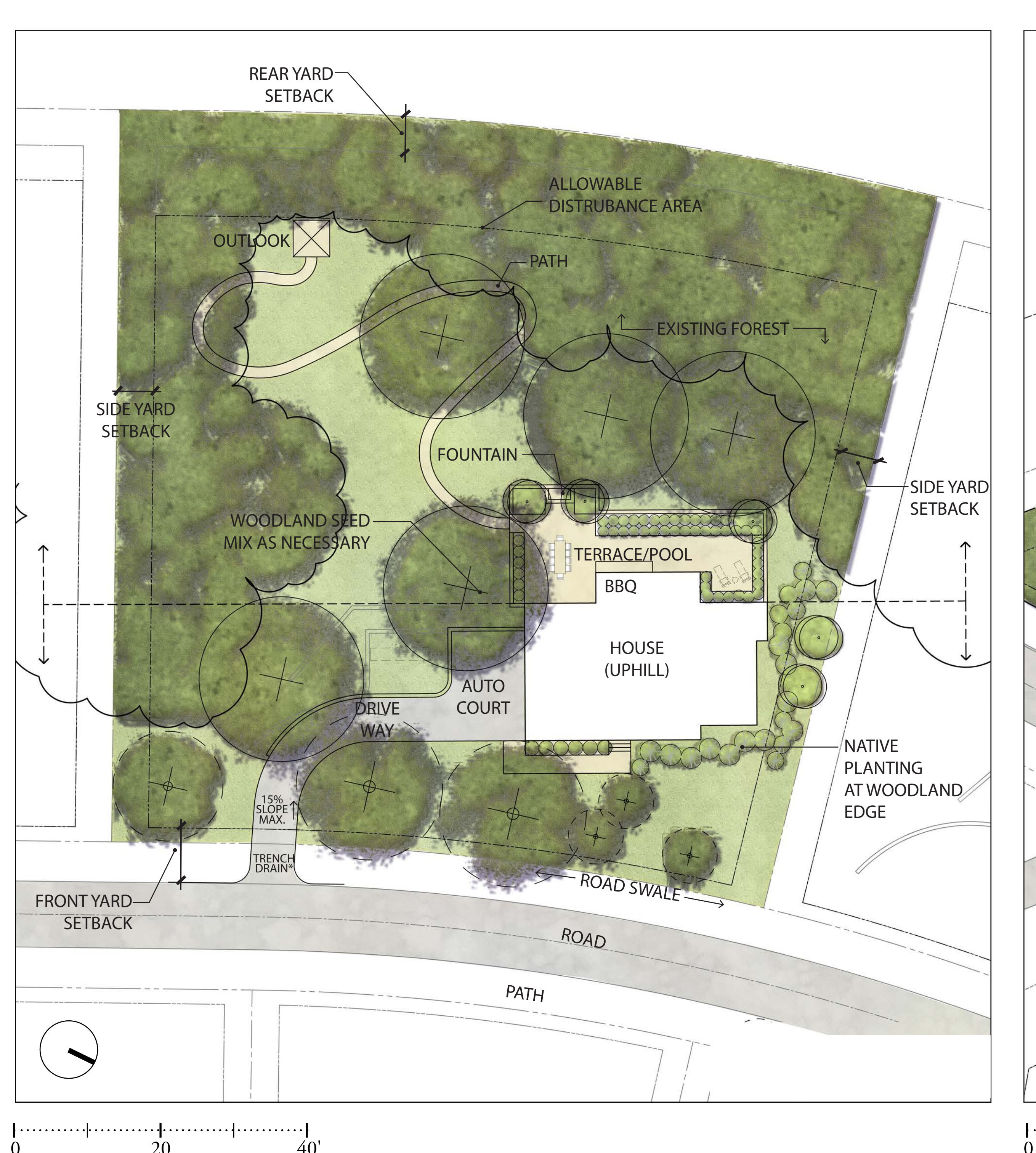
TYPICAL ESTATE HOME GOLF-SIDE LOTS